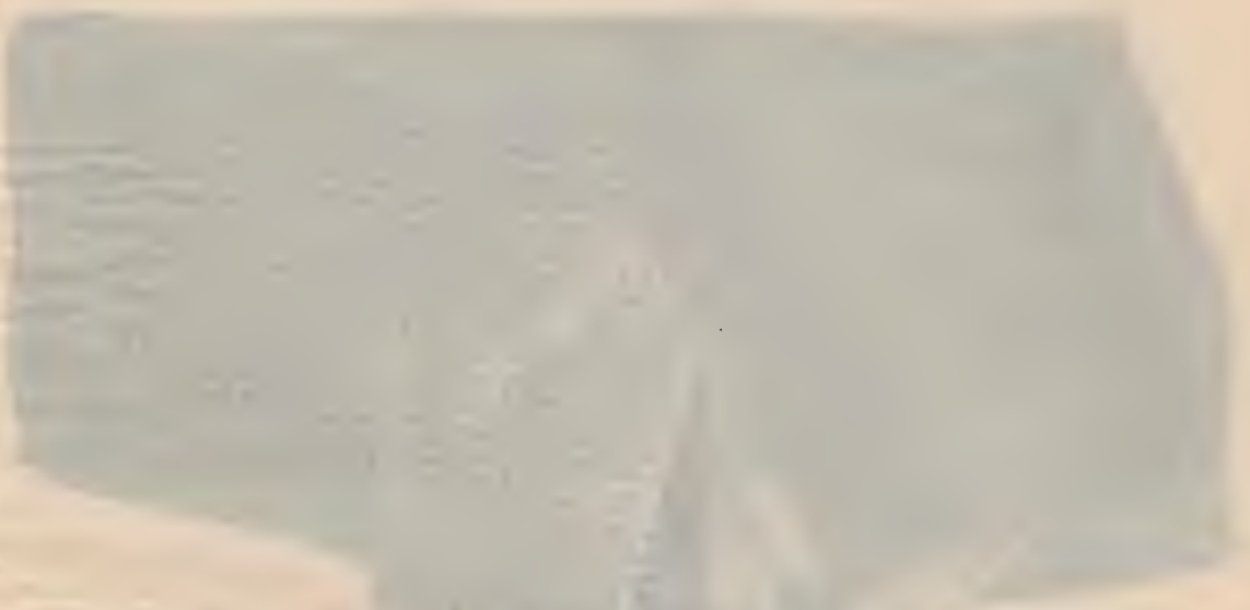
Fig. 1. A person in a light-colored garment, possibly a shirt or dress, standing in a dimly lit environment. The image is very dark and blurry, making details difficult to discern.